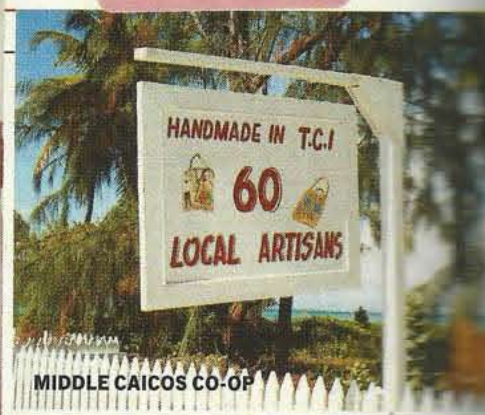
MIDDLE CAICOS CO-OP