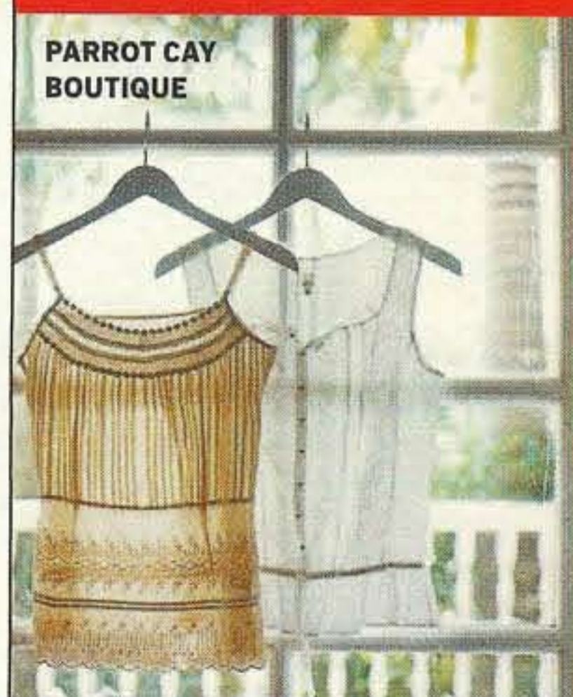
PARROT CAY BOUTIQUE

For elegant, inspired poolside wear from European and Southeast Asian labels—like Rajesh Pratap Singh's neon-embroidered kurtas and Future Paradise's painstakingly pin-tucked voile camisoles—