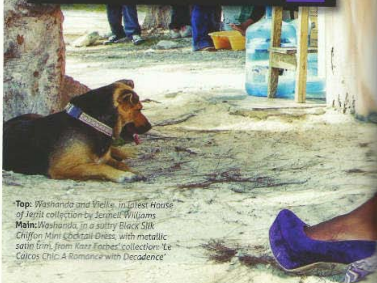
Top: Washanda and Vielke, in latest House of Jerrit collection by Jermell Williams Main: Washanda, in a sultry Black Silk Chiffon Mini Cocktail Dress, with metallic satin trim, from Kazz Forbes' collection: 'Le Caicos Chic: A Romance with Decadence'